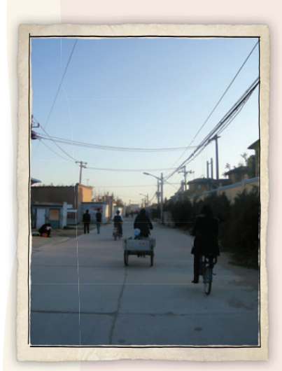
北京機場附近的一個民工村 A migrant workers' village near the airport in Beijing

《漢書》説:「安土重選,黎民之性;骨肉相附,人情所願」。 但是在一九八零年代中期以後的中國,卻有越來越多的人,選 擇離開老家的村子,離開父母子女,離開熟悉的謀生方式,離 開原有的語言與身份,到城市裡打工,適應新的社會價值,同 時揹起了充滿貶義的農民工身份。我一直想回答這個看似簡 單的問題:「民工為什麼離家?」我曾有機會和幾位因為思念 年幼的孩子而天天拭淚的媽媽民工聊這個話題。「地裡都乾 得冒煙了,如果可以的話,誰會願意離開孩子呢? | 其中一個 媽媽的回答道出了孩子的中心地位,還有她為了家庭生計無 奈的選擇。另一位三十好幾的媽媽阿玉説,種田掙不了錢,她