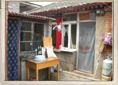
小玉的妹妹租住的房間 The room that Xiaoyu's sister rented (2011)

在刷鍋的時候,也住在同一個村子的妹妹來了。妹妹比她早離家,個性比較固執也比較有主見。她聽懂了我的疑惑,感嘆地說:「雖然我們總是盼着回家過年,念著孩子,但是回到老家以後,卻覺得心裡空空的,著急。得等到又到了北京,才覺得踏實。能掙錢,才踏實。」