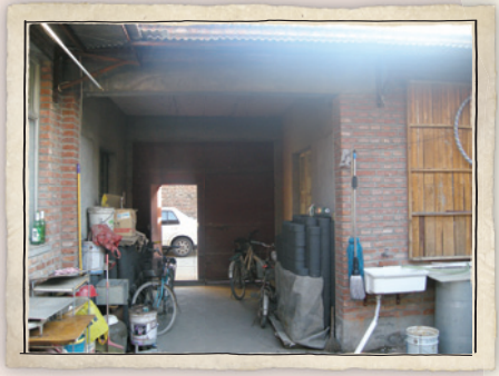
小玉的妹妹所住的院子 The courtyard where Xiaoyu's younger sister lived (2008)