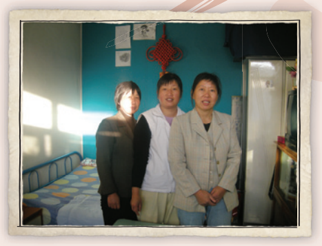
小玉的妹妹租住的房間 The room that Xiaoyu's sister rented (2008)