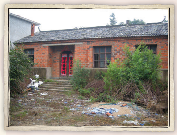
小玉的父母在村子裡廢棄了的老家 The abandoned old home of Xiaoyu's parents in the village