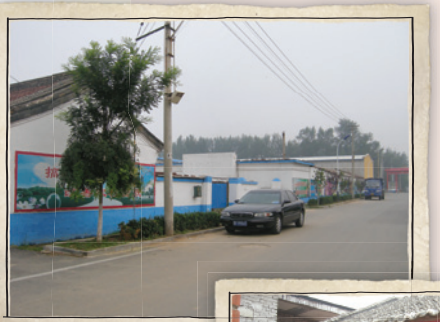
小玉的妹妹所住的村子 The village where Xiaoyu's sister lived (2011)

在刷鍋的時候,也住在同一個村子的妹妹來了。妹妹比她早離家,個性比較固執也比較有主見。她聽懂了我的疑惑,感嘆地說:「雖然我們總是盼着回家過年,念著孩子,但是回到老家以後,卻覺得心裡空空的,著急。得等到又到了北京,才覺得踏實。能掙錢,才踏實。」