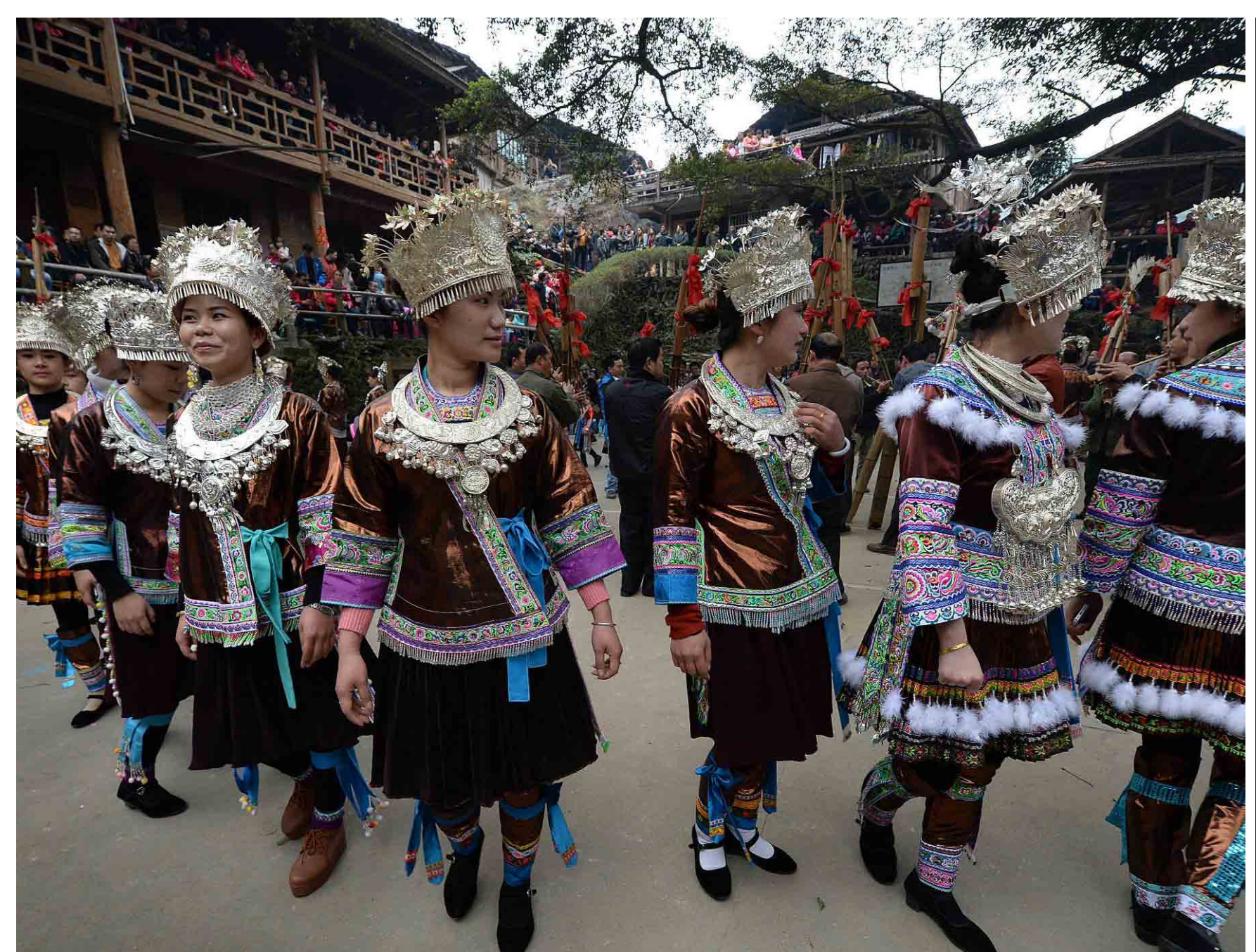
Studying anthropology helps students analyse social, cultural and political issues and broadens their understanding of cultural and social diversity.