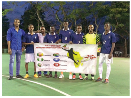
二零一五年「非洲聯合盃」的「索馬里」隊 Somalia Team in the 2015 African Unity Cup