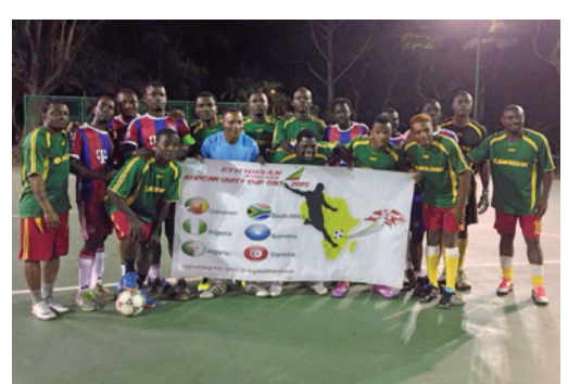
二零一五年「非洲聯合盃」其中兩隊參賽隊伍 Two of the Teams at the 2015 African Unity Cup

In 2009, some Africans living in Kam Tin decided to organize an Easter Fiesta football game to celebrate their commonality and brotherhood. As a reflection of their passion for the English Premier League, the four teams were Chelsea , Manchester United , Arsenal , and All Stars . In the last 6 years, this Easter game has since expanded in scale and even had a corporate sponsor. In 2015, the African Unity Cup had 6 teams: Tunisia, South Africa, Cameroon, Somalia, Nigeria, and Algeria. Despite the national ensign, players of each team were very much of mixed nationalities. For example, team "Tunisia" was represented by Nigerians, Gambians, and Tanzanians. Players came from all walks of life: Hong Kong Africans residents, asylum-seekers, even professional footballers. Increasing interest towards the Cup had brought the final to the heart of the city at Cherry Street Park of Yaumatei for more people to watch the game. The organizers said that hopefully next year local residents could play alongside African players, African consulates attend the game, and more corporate sponsors make it a larger event. This would further the goal of integration with local community through football.