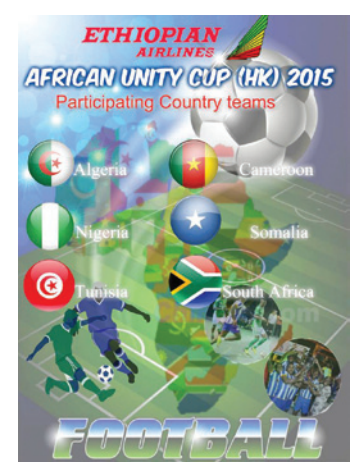
二零一五年「非洲聯合盃」海報 The 2015 African Unity Cup poster