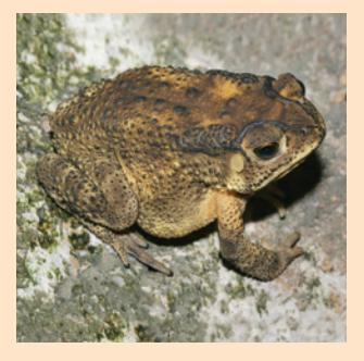
Asian Common Toad (Duttaphrynus melanostictus) 蟾蜍科 Bufonidae

译娃 Paddy Frog (Fejervarya limnocharis) 赤蛙科 Raniidae