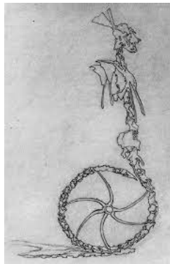
Remedios Varo, On Homo rodans (1959)