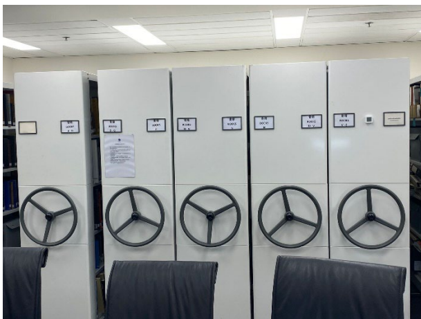
Interior of the library, I handled the labelled shelves, whose labels were also made by myself

The second task for the last 3 weeks, which was my favourite out of all tasks, was being the sole library assistant for the museum library. My main task was to catalogue new books, which include assigning call numbers and putting them in online records. I had to learn how to make a call number with the Library of Congress system. After familiarizing the system for a bit, I was invited to give advises on making an extension of the call numbers for the museum library's use, as the current system was not specific enough on some topics, such as Hong Kong. Another task was to reorganise the library, from fixing wrong orders to reorganising the entire main shelves to accommodate new books. Occasionally, I also have to handle book requests from research assistants from universities. The whole library assistant task seems difficult and complicated on paper, because it really is that difficult in practice. However after looking at the revamped library and my handover report of the library, I really felt like my efforts are meaningful and I am very thankful that the museum had put a lot of trust in me for this task.